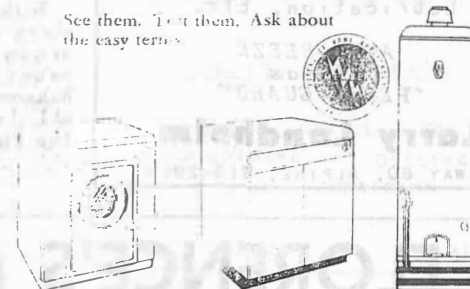
AUTOMATIC ELECTRIC WASHER

See them. Test them. Ask about the easy terms.