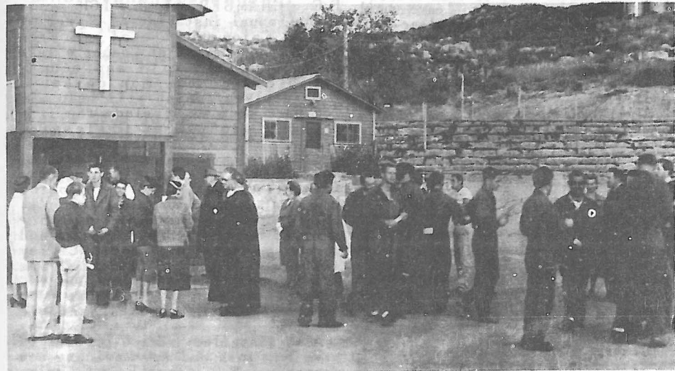
CHRIST CHAPEL IN THE MOUNTAINS DEDICATED. SEE STORY, PAGE 14.

Monday's rain which brought a 3 a.m. deluge, registered over a third of an inch on the gauge at Durbin Ranch, Japatul, the popular E.C. feedman reports.